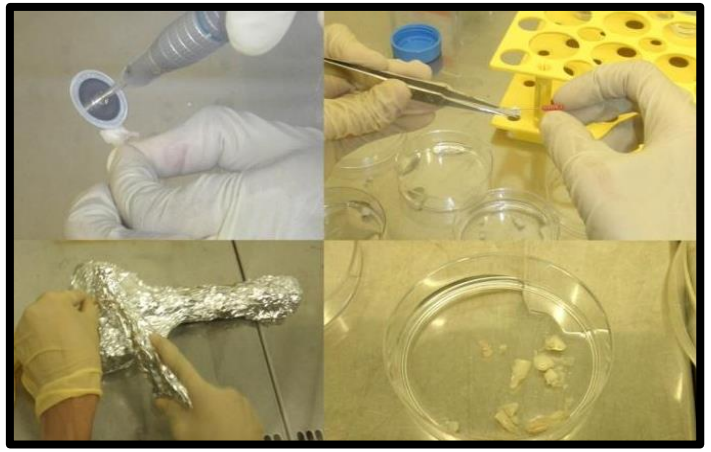
Figure 1: Methods of retrieving pulpal tissues

The isolated cells' surface phenotypic profile was ascertained by flow cytometric analysis. Detachable cells were counted. On the proper number of cells, 10µl of tagged primary antibody was added. As control groups, IgG2 (immunoglobulin G2) and IgG1 (immunoglobulin G1) isotopes were employed. On the ice, the cells were stained for one hour. Subsequently, 500µl of FACS buffer was pipetted thoroughly before being placed in tubes for flow cytometry. The flow cytometry machine was utilized to run the samples. BD The software CellQuestTM Pro Version 5.2.1 was utilized to examine the flow cytometric data. FITCconjugated CD-34, CD-105, and PE (R-phycoerythrin)conjugated CD-45, CD-90, CD-73, and HLA-DR antibodies had been utilized to stain the cells. For every marker, ten samples underwent the same procedure. The expression of cell surface marker expression from flow cytometric analysis was calculated as the arithmetic mean ± Standard Deviation (SD).