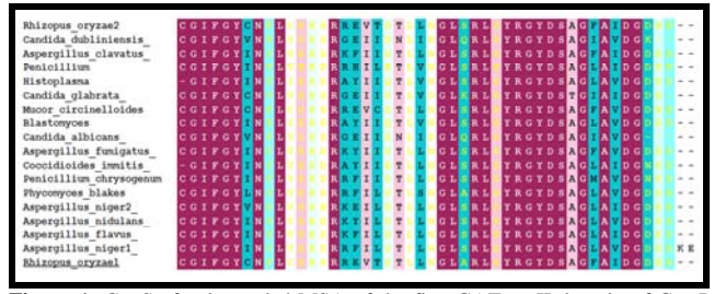
Figure 1: ConSurf color-coded MSA of the first GATase II domain of G-6-P synthase using amino acid sequences of mycoses-causing fungi. The pink to blue color gradient represent highly conserved to variable regions of the domain. The yellow marked amino acids indicate that the calculation for the particular site was performed on less than 10% of the sequences.

database [4], NCBI fungal database [5] and The DOE Joint Genome Institute fungal database. A total of 20 sequences were retrieved and compiled from these databases. The online server PFAM was used to investigate protein domains present within the enzyme. Subsequently, the sequences were manually separated according to the domains predicted by PFAM. Further, the protein sequences were aligned using the offline software CLUSTALX2 [6]. MEGA v5.0 [7] was employed to infer the evolutionary history using the Neighbour-Joining method. The bootstrap consensus tree inferred from 1000 replicates is taken to represent the evolutionary history of the taxa analyzed. The evolutionary distances were computed using the Poisson correction method. All positions containing gaps and missing data were eliminated. Additionally, the functionally important amino acids were identified using ConSurf webserver.