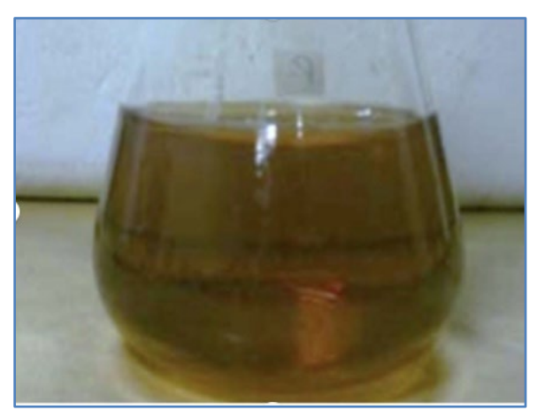
Figure 2: The image depicts the preparation of Supercritical fluid – 250 g of tulsi powder taken and soaked in 1000 ml of ethyl alcohol for 48 hours.