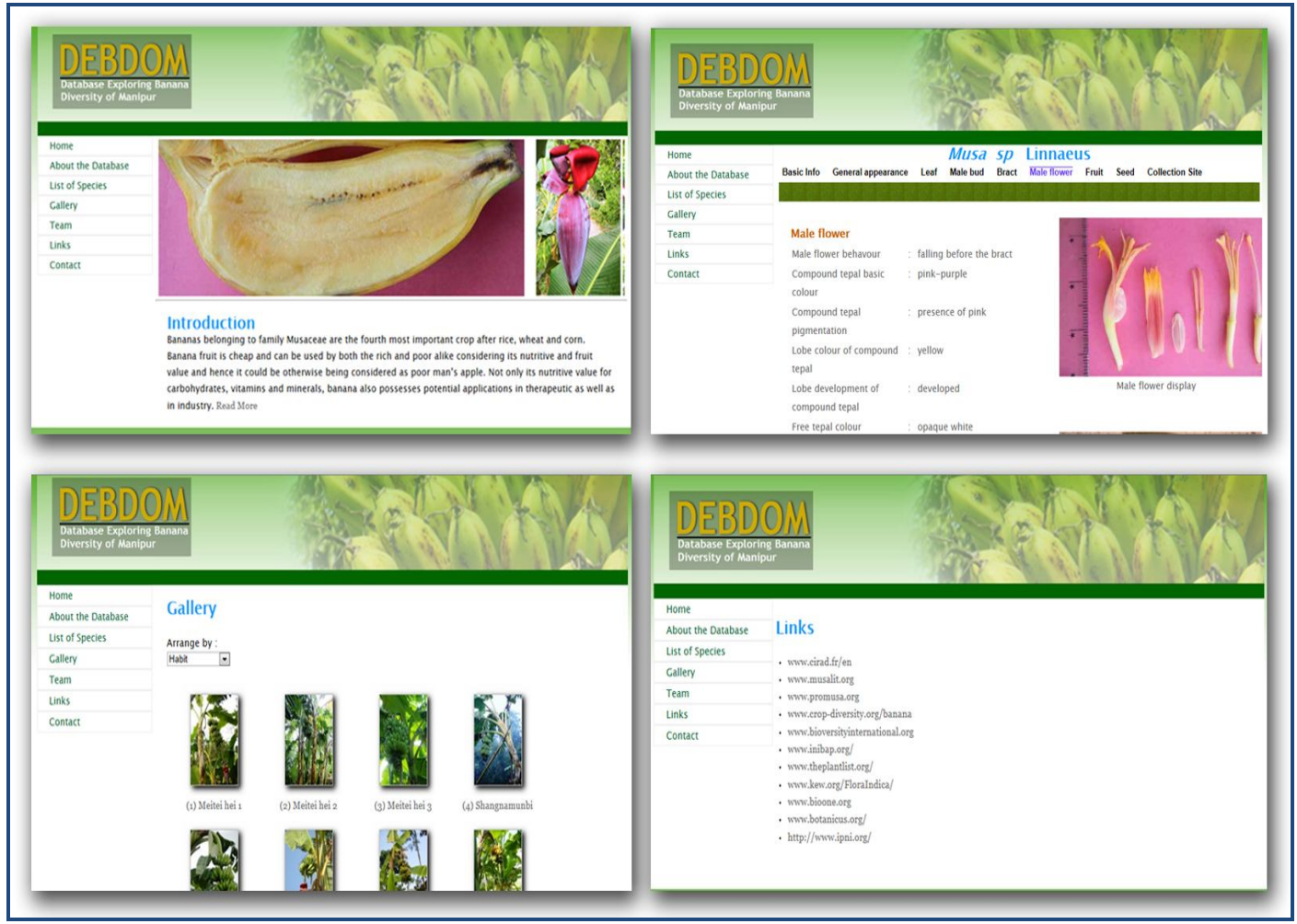
Figure 1: Snapshot demonstrating Home, Male flower, Gallery and Links page/s of DEBDOM.